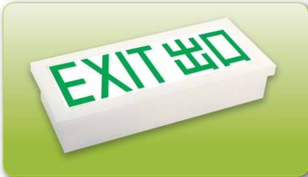
"CRYSTALITE" Cat. CX-LED-405-B-RL