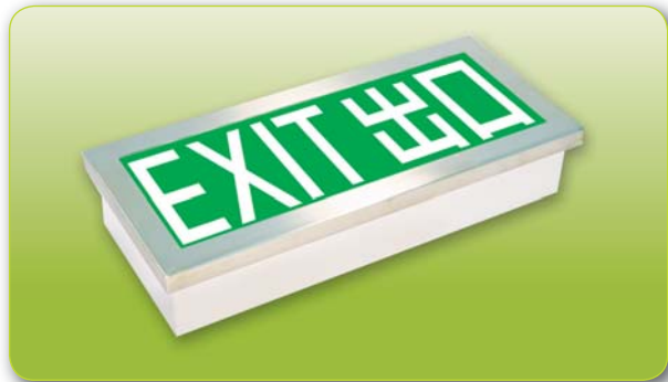
"CRYSTALITE" Cat. CX-LED-405-B-RL-H Hairline stainless steel finishing cover